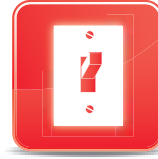
Secure Power Supply